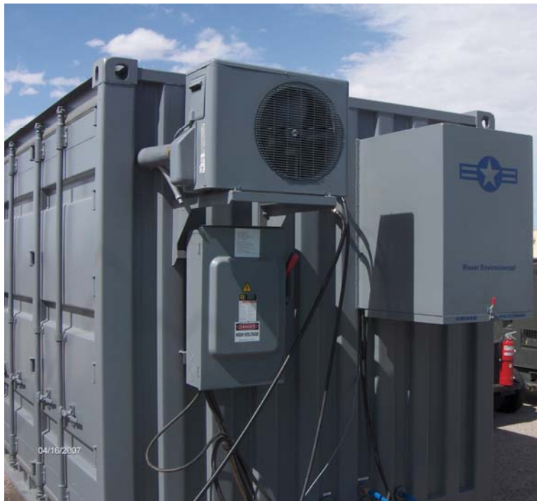
Hardened Wash Bay enclosure with air conditioning, heat and custom desert air filter, painted Air Force grey