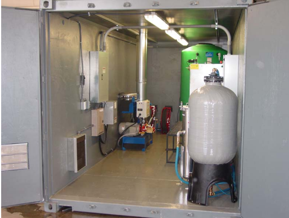
20' hardened enclosure with Cyclonator Deuce, hot water pressure washer, water cannon, two hose reels mounted at back, high pressure auto backwashing media filter in foreground NEMA 4 electrics, automatic energy saving lights