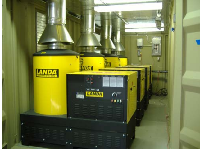
4 hot water pressure washers in hardened enclosure