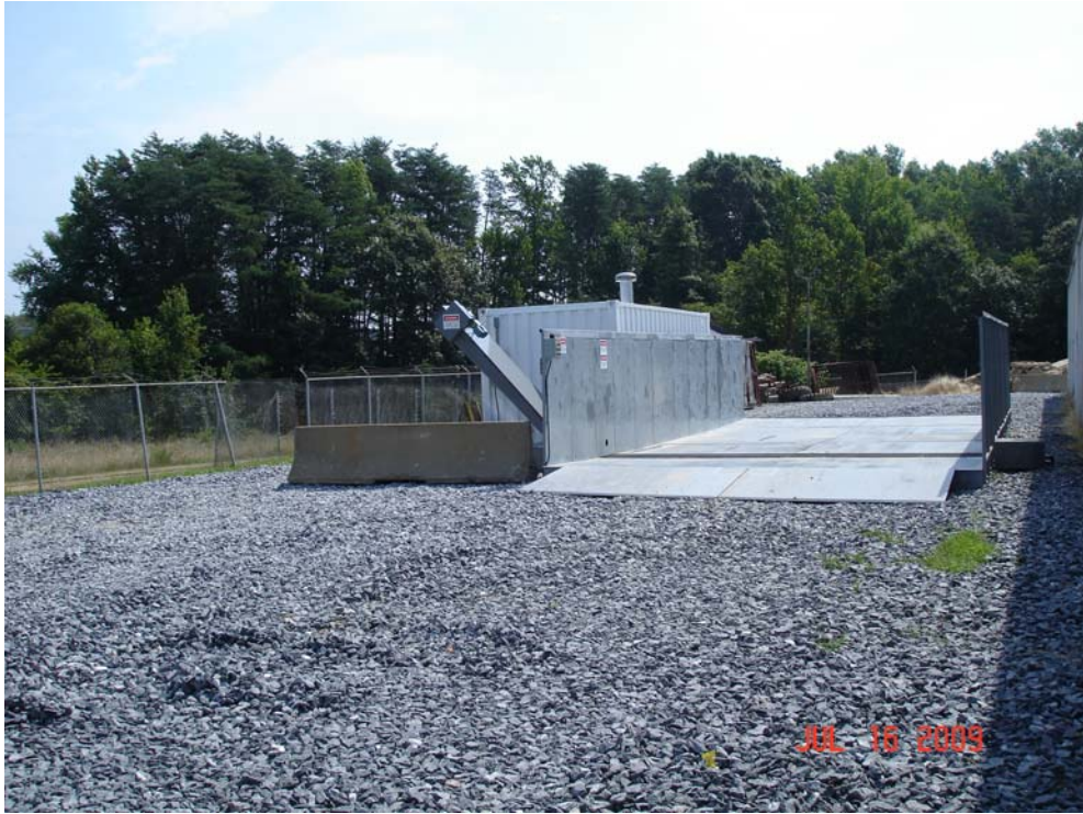
Marine Corps, (CIBRF) 18' x 35' pad with conveyor (left side). Drive thru configuration Filtration equipment and pressure washer installed in all-weather enclosure Rack installed on slightly improved surface