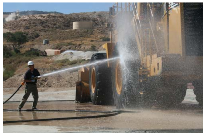
Riveer water cannon